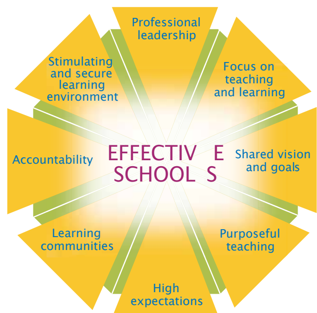
Figure 2: Effective Schools Model

The key success factors that help make schools safe parallel the eight elements contained in the Effective Schools Model 9 . The model provides a useful framework for schools to plan and develop a whole-school approach to a safe, secure and stimulating learning environment where bullying and unacceptable behaviour is not tolerated.