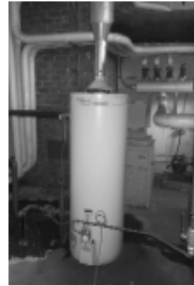
Centralised domestic hot water system